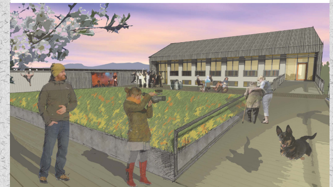
"Passivehouse Linesøya". Student project spring 2010, Energy- and environmental friendly architecture, master course, NTNU.