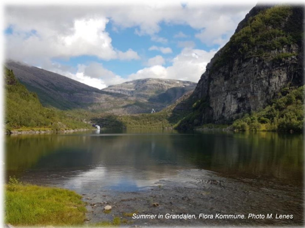
Summer in Grøndalen, Flora Kommune.