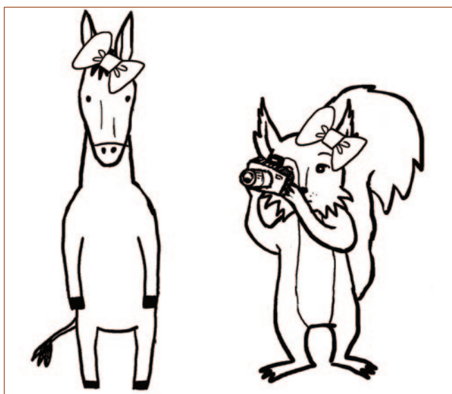
Fig. 2 Frau Eichhörnchen fotografiert Frau Esel