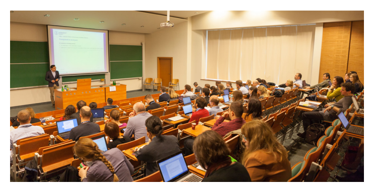
Audience at workshop

both in small and large N studies, and the fundamental choice between most similar and most different systems designs. Another key issue in conducting comparative empirical research is to ensure equivalence, i.e., the ability to validly collect data that are indeed comparable between different contexts and to avoid biases in measurement, instruments and sampling. Frank went on to introduce a typology of different types of research questions that can be addressed with comparative research, as well as the most common statistical techniques associated with those research guestions. Finally, he discussed how trends such as globalization alter our understanding and practice of conducting comparative research. The talk concluded with suggestions as to how comparative designs need to expand to account for these trends. The manuscript can be found here: http://www.nccr.democracy.uzh.ch/publications/ workingpaper/pdf/wp_86.pdf