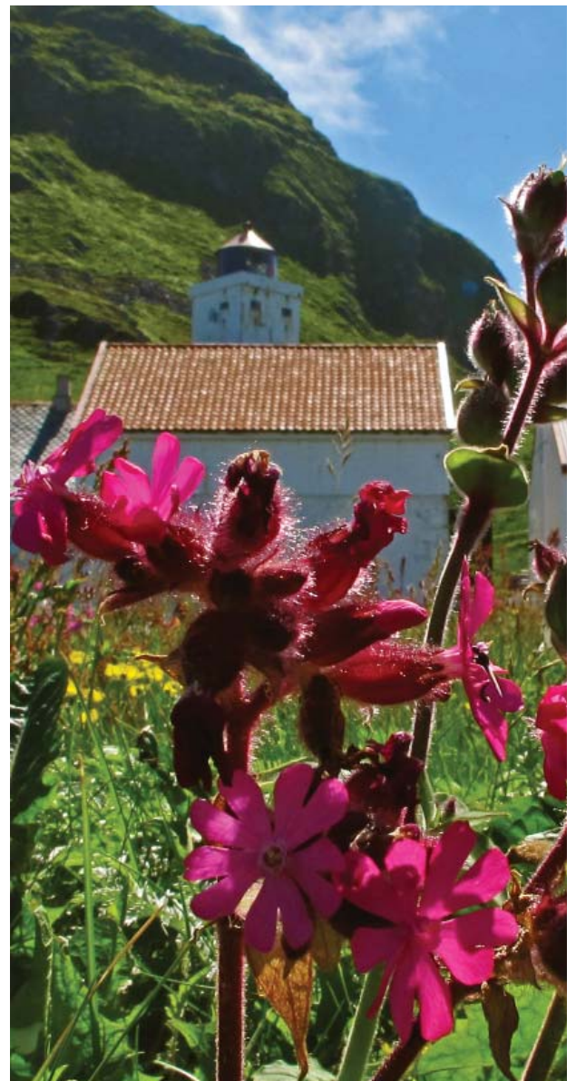
White campion by Per H. Olsen

Application deadline for submission of the preliminary application is 1 December for applicants with an educational background from outside the Nordic countries. For applicants with a Norwegian/Nordic degree, the application deadline is 15 April.