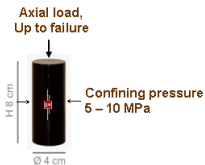
FIGURE: Original Glass sample with strain gage.

* Laboratoire de Géologie, CNRS, UMR 8538, École Normale Supérieure, Paris mallet@geologie.ens.fr