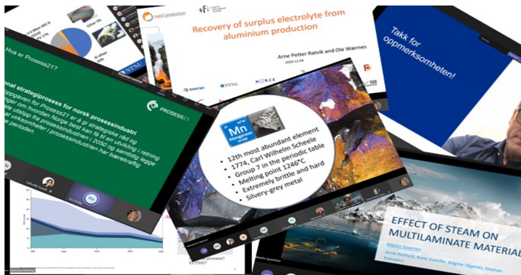
A collection of the interesting presentations given during the SFI Autumn Meeting November 3-4.

The SFI Metal Production Autumn Meeting was organized as a webinar November 3-4. More than 70 participants from the SFI-partners attended. Participants from industry and academia enjoyed interesting lectures and discussions.