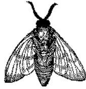
Figure 2: A sample black and white graphic that has been resized with the includegraphics command.

As was the case with tables, you may want a figure that spans two columns. To do this, and still to ensure proper “floating” placement of tables, use the environment figure* to enclose the figure and its caption. and don’t forget to end the environment with figure* , not figure !