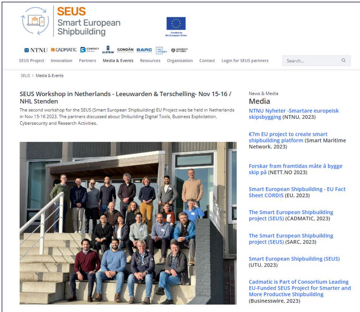
Figure 3 - Media & Events at the SEUS website

The website also allows access to the internal SharePoint repository to its members, in the Login for SEUS Partners Tab . For more information on the nature of the repositories, see D6.1. For the role of the website in the dissemination and communication activities, as well as the principles for open access, consult D6.6 (M6) and D7.3 (M6).