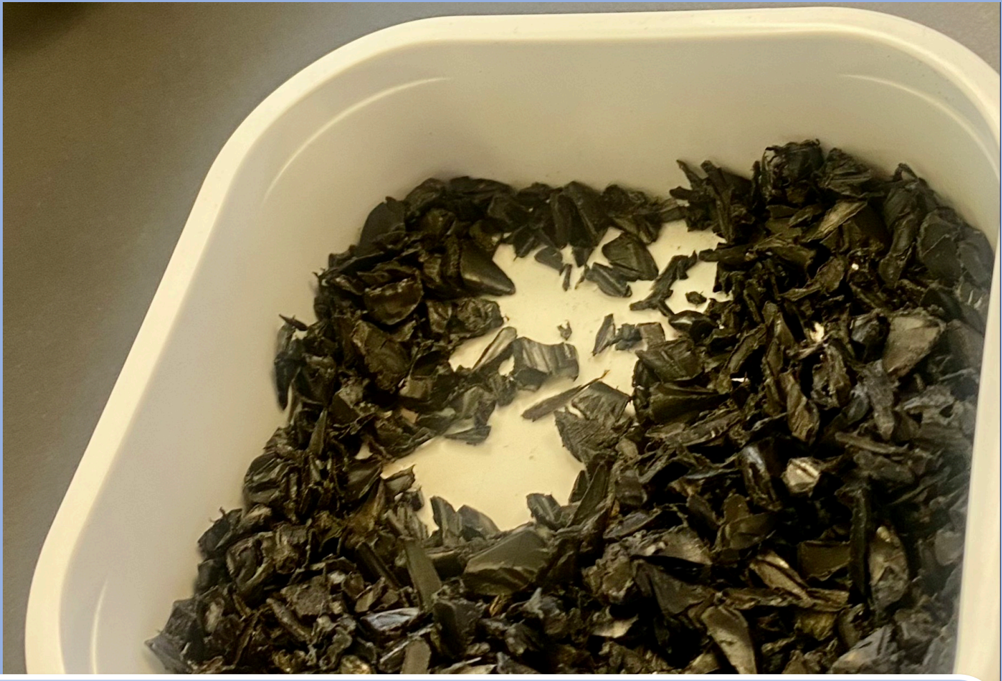
Hard plastic (recycled) from BEWI Norplasta