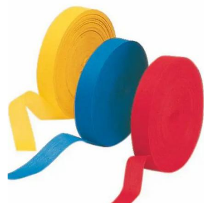
Figure 2. The most likely bands that will be used in a tri-colour

The course will be marked by multi-colored bands, and local students showing the way at certain intersections.