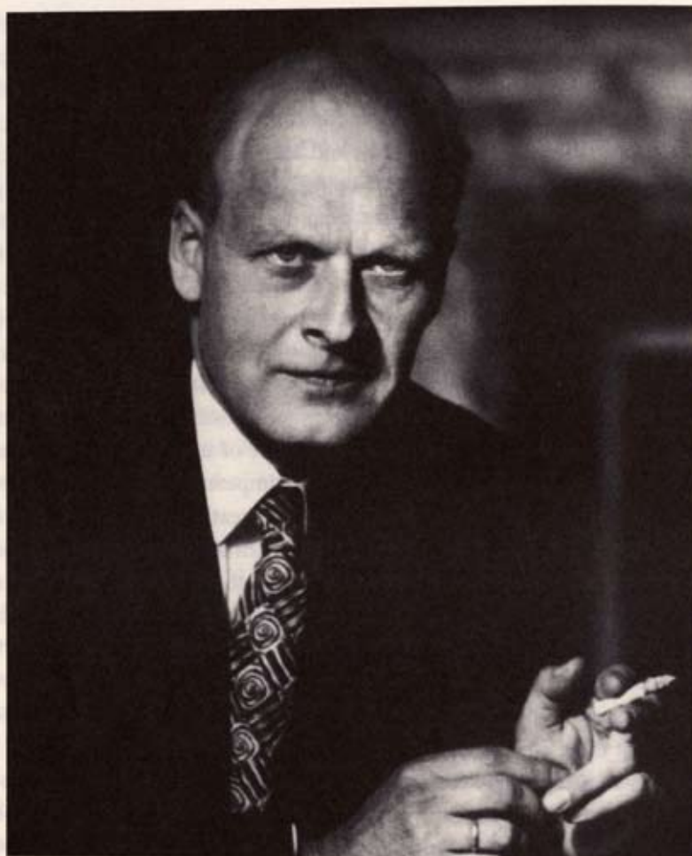
Lars Onsager 1943.

and consequently had time to prepare the next jewel in the crown: the solution of the two-dimensional Ising model.