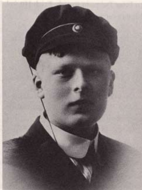
Onsager as a student in 1920.

with the opposite sign). He found a way of correcting the error, and the result was a revised theory which corresponded very neatly with experimental observations. Debye and Hückel's expression for electrical conductivity in electrolytic solutions contained an undetermined constant which they had to adjust to fit the experimental measurements. Onsager, however, equipped with his new theory, managed to calculate the constant. 14 That a student, halfway through his studies, could contribute to frontline research in this way is, obviously, very impressive. More importantly, though, this early experience had a formative impact on his career. Electrolyte theory became a lifelong love.