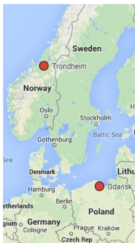
Location of the workshop cities

The ideas were put forward in the form of an open presentation at the end of the workshop, where the students shared their ideas, experiences and proposed possible solutions. They agreed that waterfronts in today's globalized world are developing in the same manner, driven by city branding, private sector investment and real-estate market demand. However, the lack of public sector involvement may contribute to the process of gentrification and unaffordability and be destructive to the reach heritage and good image of a coastal city. The workshop was a success and the students went back home with food for thought and lots of memories.