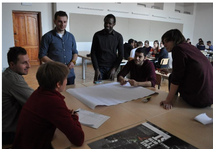
Student workshop in Gdansk