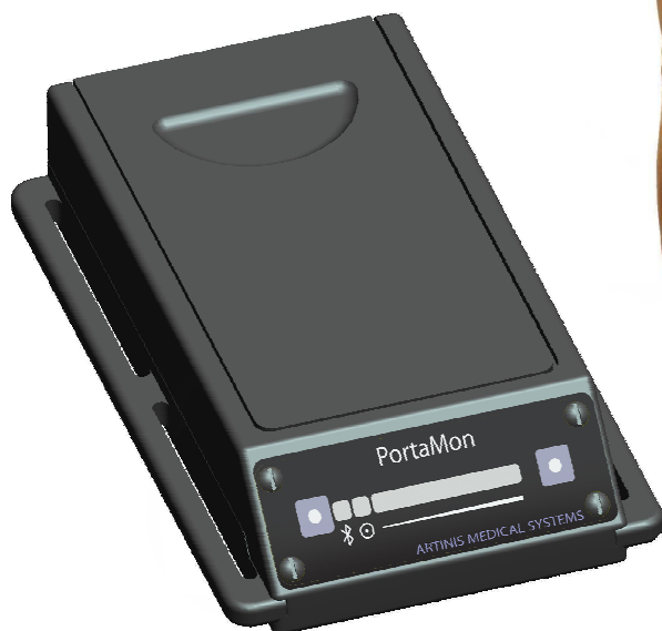
Portable NIRS device: The PortaMon

Furthermore it calculates the tissue saturation index (TSI) in percentage, which reflects the average saturation of the underlying muscle tissue.