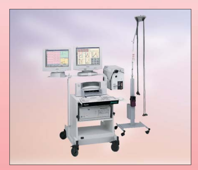
■ CPET unit with ECG screen and suction electrodes