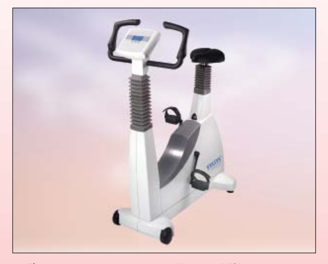
■ The new ergometer generation: VIAsprint 150P