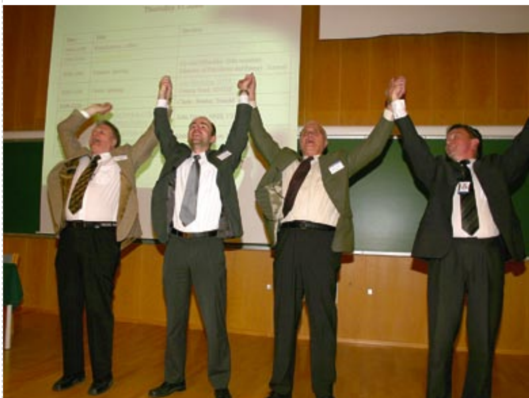
WAVE ENERGY. Centre for Renewable Energy NTNU-SINTEF [SFFE] opened in June 2004 with an international seminar. A symbolic "wave" - performed by representatives from NTNU, SINTEF and the Ministry of Petroleum and Energy - officially opened the centre.