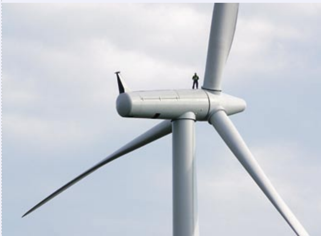
THE POWER OF WIND: An increasing number of countries are investing in wind power.

In the last 30 years NTNU and its technology transfer partner SINTEF have jointly developed an 8,000 square metre, 38 million Euro research facility, the ENGAS Research Infrastructure, where research is conducted to find ways to clean up CO 2 , NO x , SO x and other greenhouse gases, as well as investigating the removal of these gases from the oil and gas production processes and their use in industry, buildings and transport.