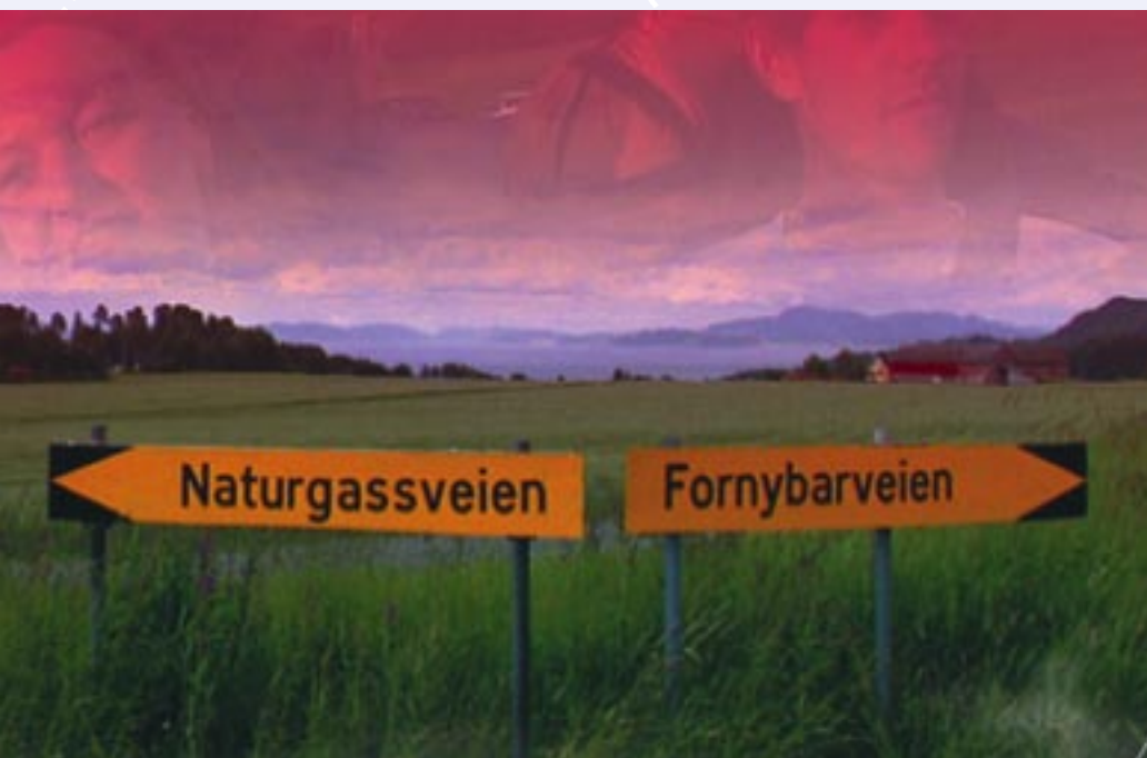
WHICH ROAD TO TAKE? Left: "Natural gas road" or right: "Renewable energy road"? (Photo from "The Road to the Hydrogen Society". Director: Ragnhild Krogvig Karlsen).

The goal of the activity within the Centre is to contribute to public and political understanding of the importance of increased use of renewable energy in society, as well as contributing to strategies and new knowledge for the innovation and development of new technologies for increased exploitation of renewable energy resources in cooperation with Norwegian industry. ( http://www.ntnu.no/sffe/ )