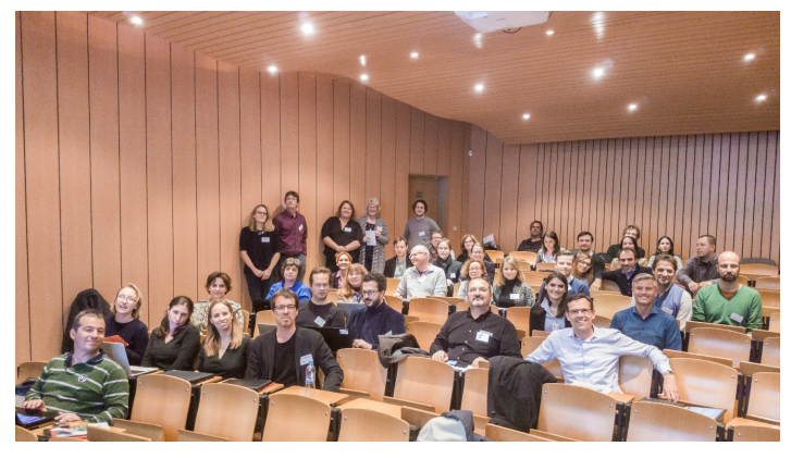
6th COST Meeting, Praha, November 2016

Other major achievements from year 3 include the publication of a special issue on populist online communication initiated by our Early Stage Researcher Think Tank ( Information, Communication & Society, volume 20, issue 9). The Training School that was scheduled for year 3 in Bucharest, Romania was organized as planed in May 2017, although organizational changes in COST technically made this into a grant period 4 event. As in previous years, we have also completed a number of Short Term Scientific Missions. We are certainly on schedule as we enter our fourth and last year of the action.