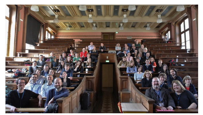
COST Meeting, Paris, Amphitheatre Lefebvre, Sorbonne