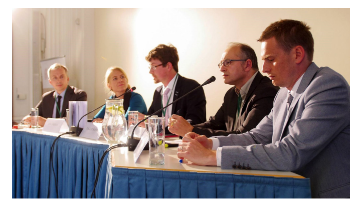
Prague Populism Conference, May 2017