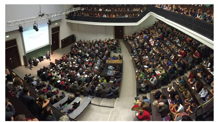
Stakeholder Meeting, Munich, October 2016