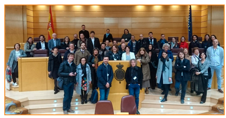
COST Action meeting, Madrid, March 2018

7th MC Meeting, WG Meetings and Action Conference, 19-21 March 2018 at Universidad Rey Juan Carlos, Madrid, Spain