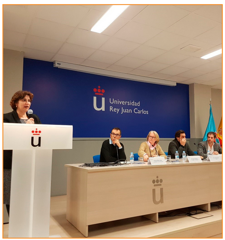
Stakeholder round table

All three experts also reminded the audience that this new situation is not only the results of Podemos or the independent parties, but that it has also been initiated by the traditional parties in Spanish politics. A populist communication strategy has been used for years by all parties in order to win elections.