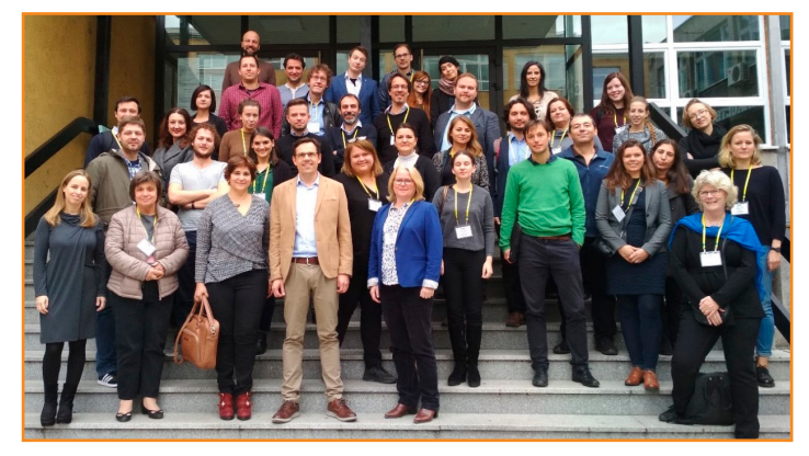
COST Action meeting, Sarajevo, November 2017

Working Group Meetings, 2-3 November 2017 at Faculty of Political Science, University of Sarajevo, Bosnia and Herzegovina