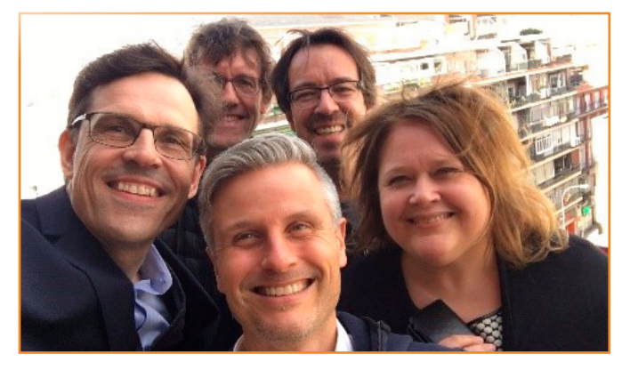
COST Action IS1308: Core group

The International Journal of Press/Politics selected a proposal from the COST Action for a special issue on populist political communication. The interest in the special issue was overwhelming with more than 70 submissions from across the globe. A selection of proposals was made in fall 2017 and these proposals were developed into full papers which were presented at the Action conference in Madrid 2018. On the basis of peer review, a sub selection of these will be included in the actual special issue. The special issue will also include an Introduction article by the COST action core group in which the scope of the special issue and a future, comparative research agenda is discussed. It was exciting to see the amount and the quality of the proposals and it suggests how vibrant and important the theme is in the global research community.